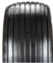
13" Grooved Polyresin Tread