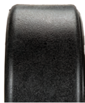
13" Smooth Polyresin Tread