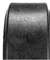
15" Smooth Polyresin Tread